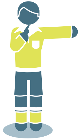
Direct free kick