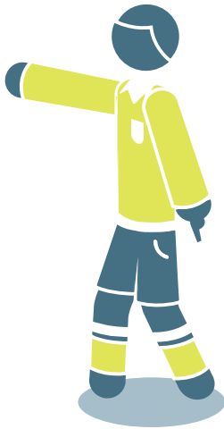
Advantage (1) |