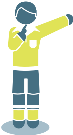
Corner kick |