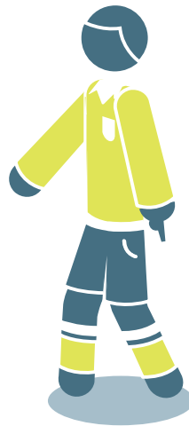
Goal kick |