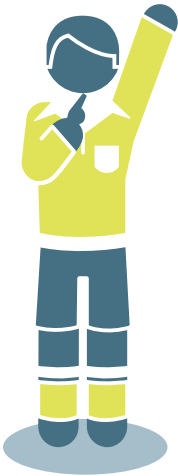
Indirect free kick